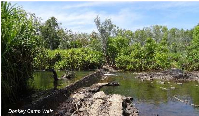
Donkey Camp Weir

After lunch we went to Donkey Camp Weir, hoping to see a Great-billed Heron. No GBH but first Banded Honeyeaters for the trip. Then we continued on to Nitmiluk where we saw Great Bowerbirds and a bower. Great Bowerbirds were one of the species we saw everyday.