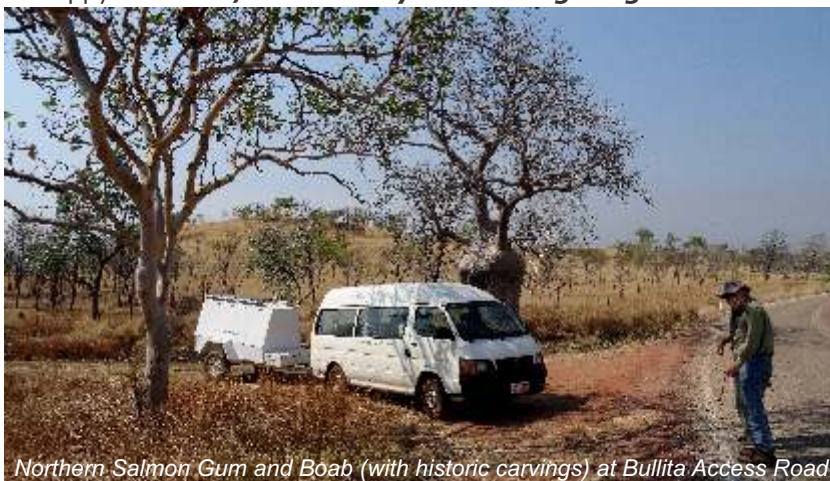
Northern Salmon Gum and Boab (with historic carvings) at Bullita Access Road

We continued straight through to Katherine, staying again at the Beagle Motor Inn and ate at the Escarpment Restaurant. We did the bird call back at the Beagle. Despite searching nearby powerlines around Katherine where I have seen them before, still no Zebra Finches. This is the one species all in the group have already seen in the wild, so we are all happy with the 9/10 final tally for finch sightings.