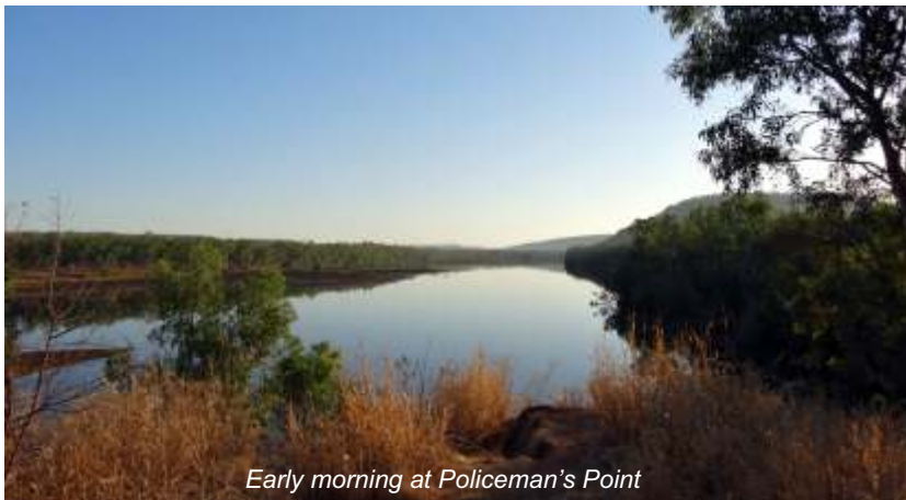
Early morning at Policeman's Point

We had lunch at the Victoria River Roadhouse and walked over the old bridge. No sign of Purple-crowned Fairy-wrens, no doubt the heat of the day made it unlikely to see them.